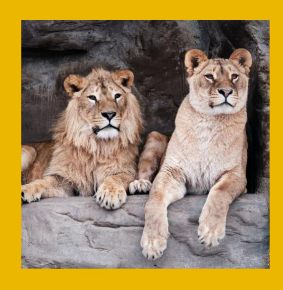
Sioux Empire Lions