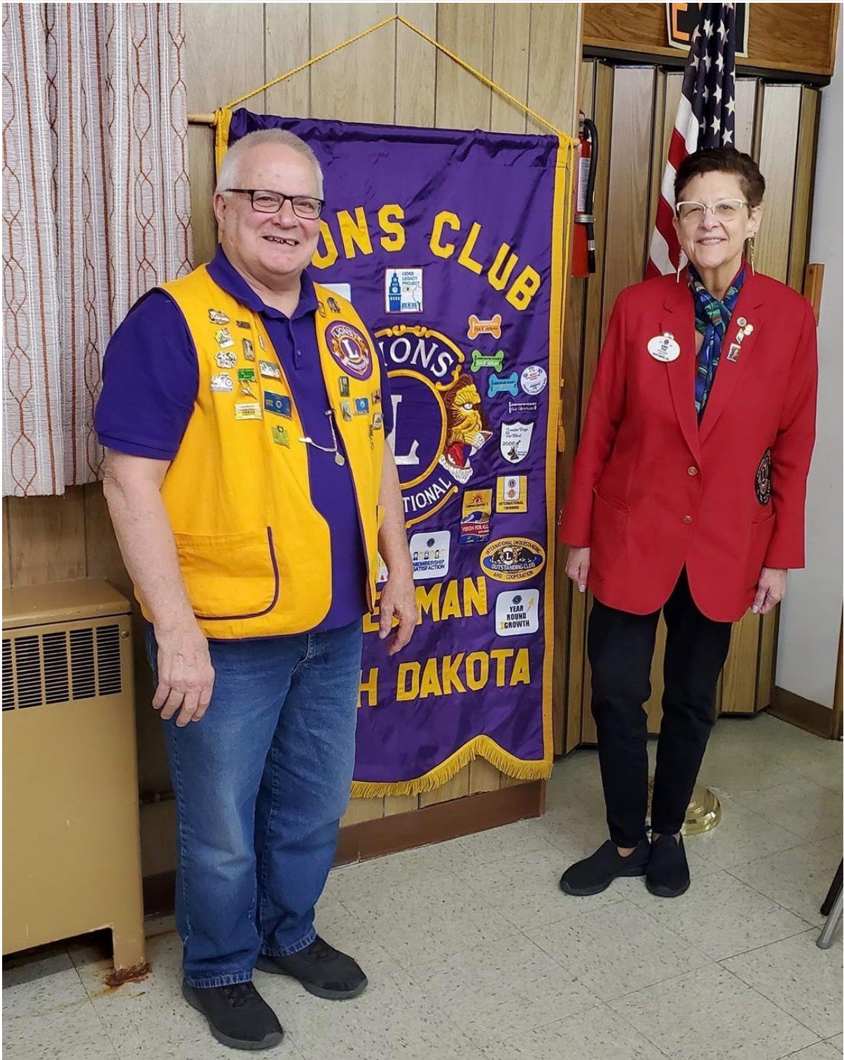
Got some Lions club visits in before the next round of snow! Thank you to the Freeman and Alcester Lions. Both clubs are an integral part of their communities.