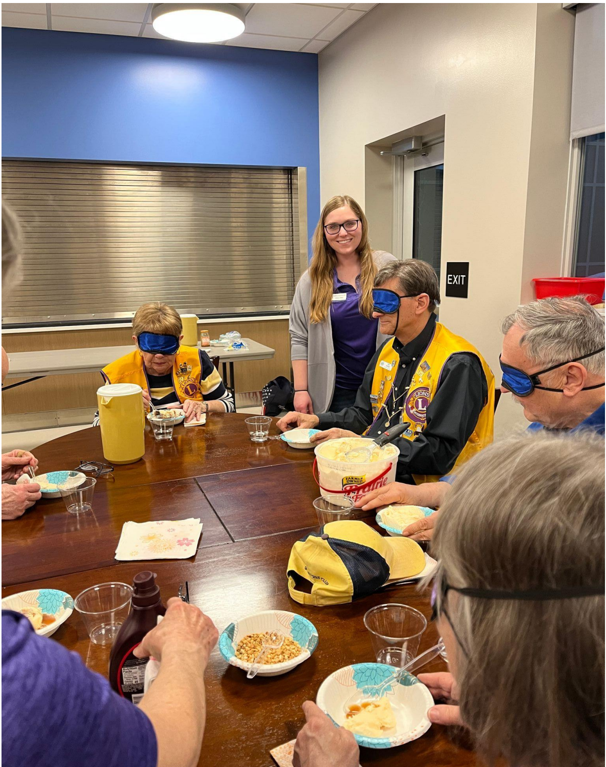
Lions from Zone 1 at the April zone meeting having "Dessert in the Dark". The zone meeting was hosted by the Aberdeen Lioness Lions club and held at SDSBVI.