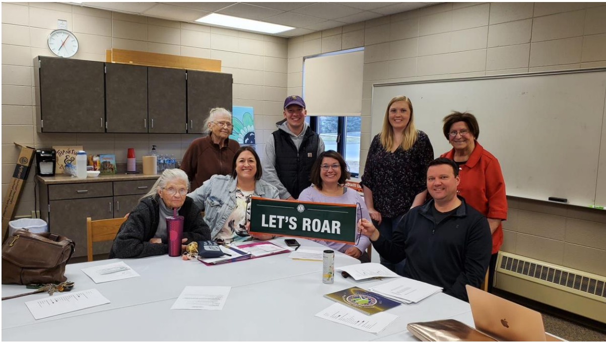
Thank you Lennox Lions for great hospitality and the service to your community! Sounds like Lennox is the place to be on July 4th!