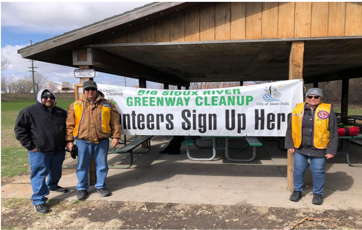
Sioux Empire Club participated in the Big Sioux River Clean-up Day in observance of Earth Day and Lions Week of Service.