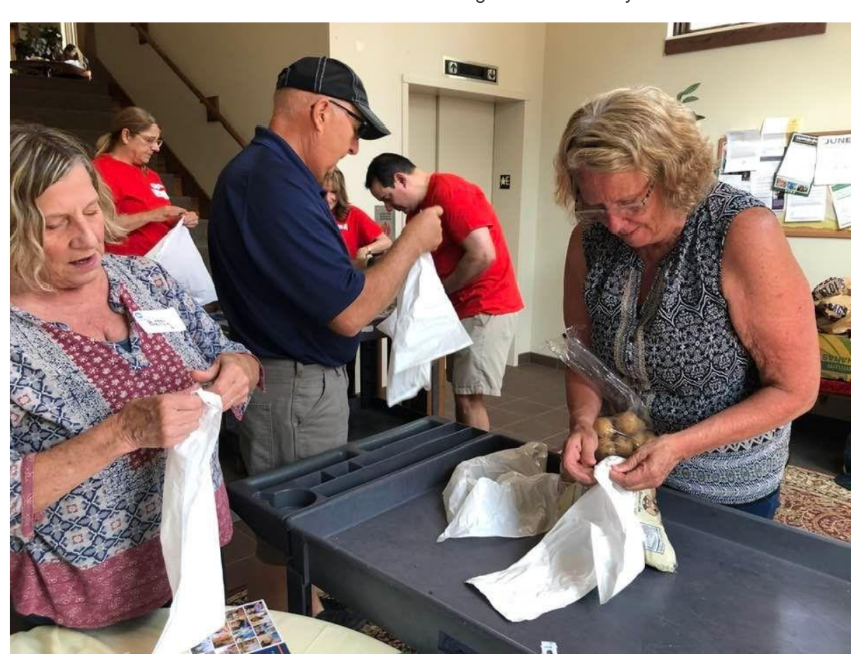
Zone 7 Lions package and distributed food at "Food To You" on June 15 at Augustana Lutheran Church. We served 350 to 375 individuals that evening. It's A Great Day to be a Lion.