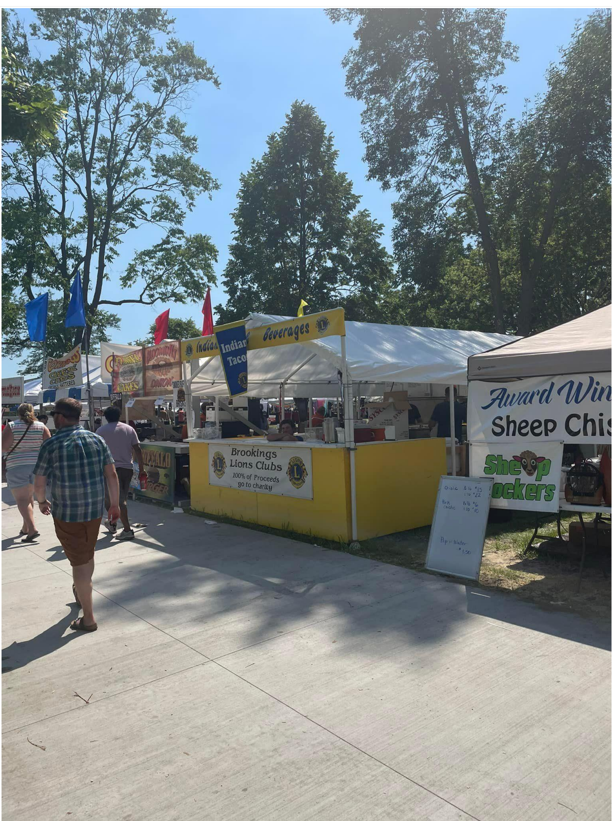
Now that it's summer season, don't forget to support fellow 5SE Lions Clubs! We were able to support out both Brookings Clubs today at the Brookings Summer Arts Festival.