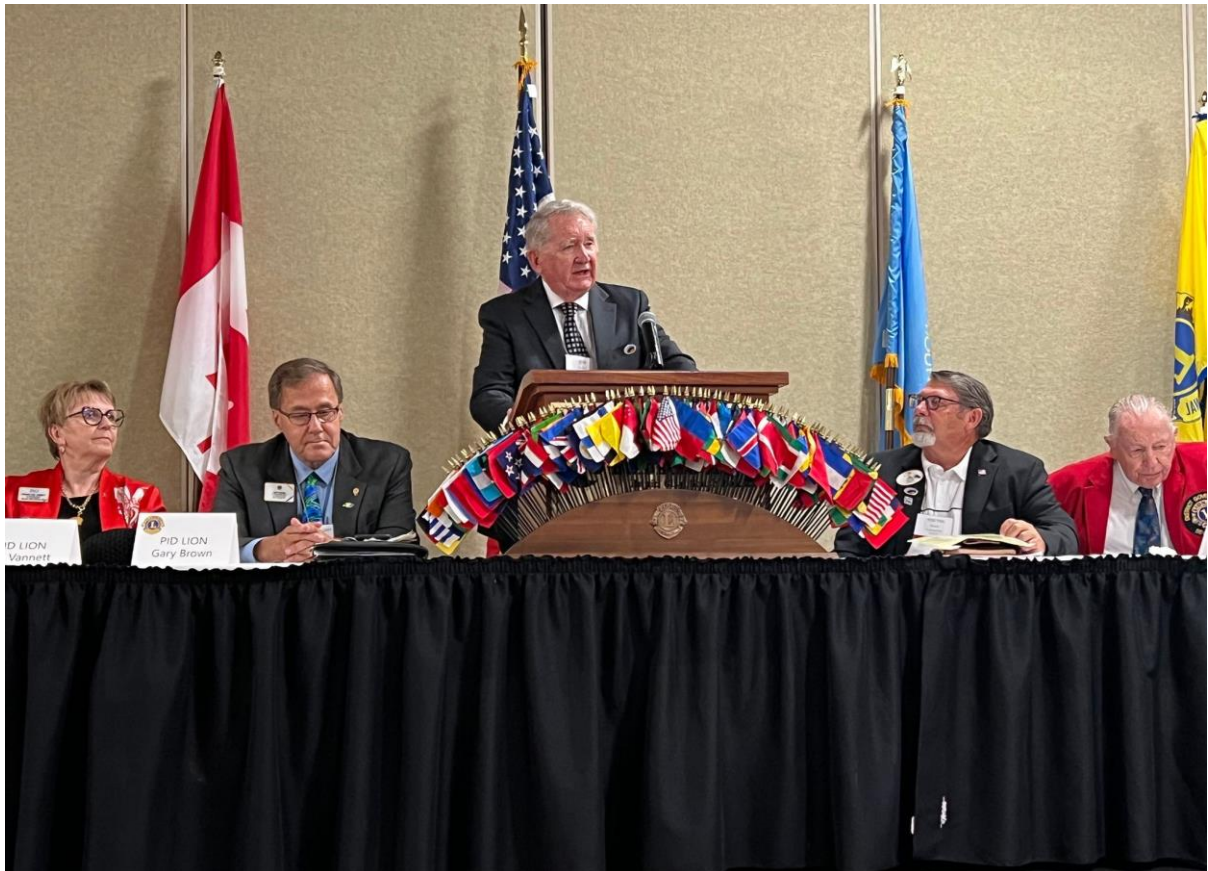
Former Rapid City Mayor Don Barnett spoke about his experience as mayor during the tragic 1972 flood. He was 30 at the time. The first LCIF grant of $5,000 was given to help the recovery efforts from that flood. That's about $35,000 in today's dollars.