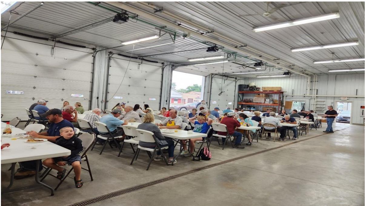
Lions Pancake breakfast at Britton Harvest Days celebration.