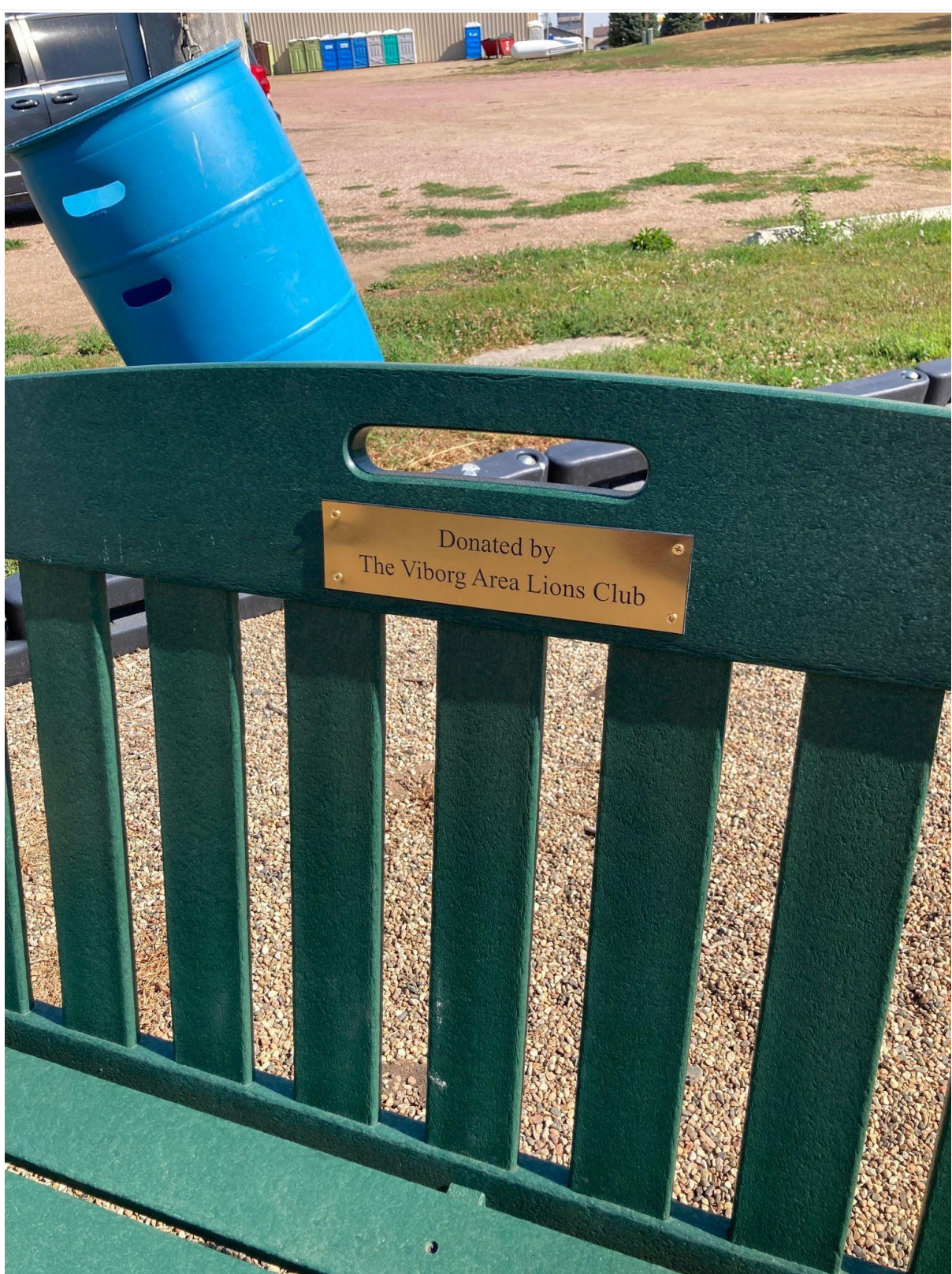
Viborg Area Lions