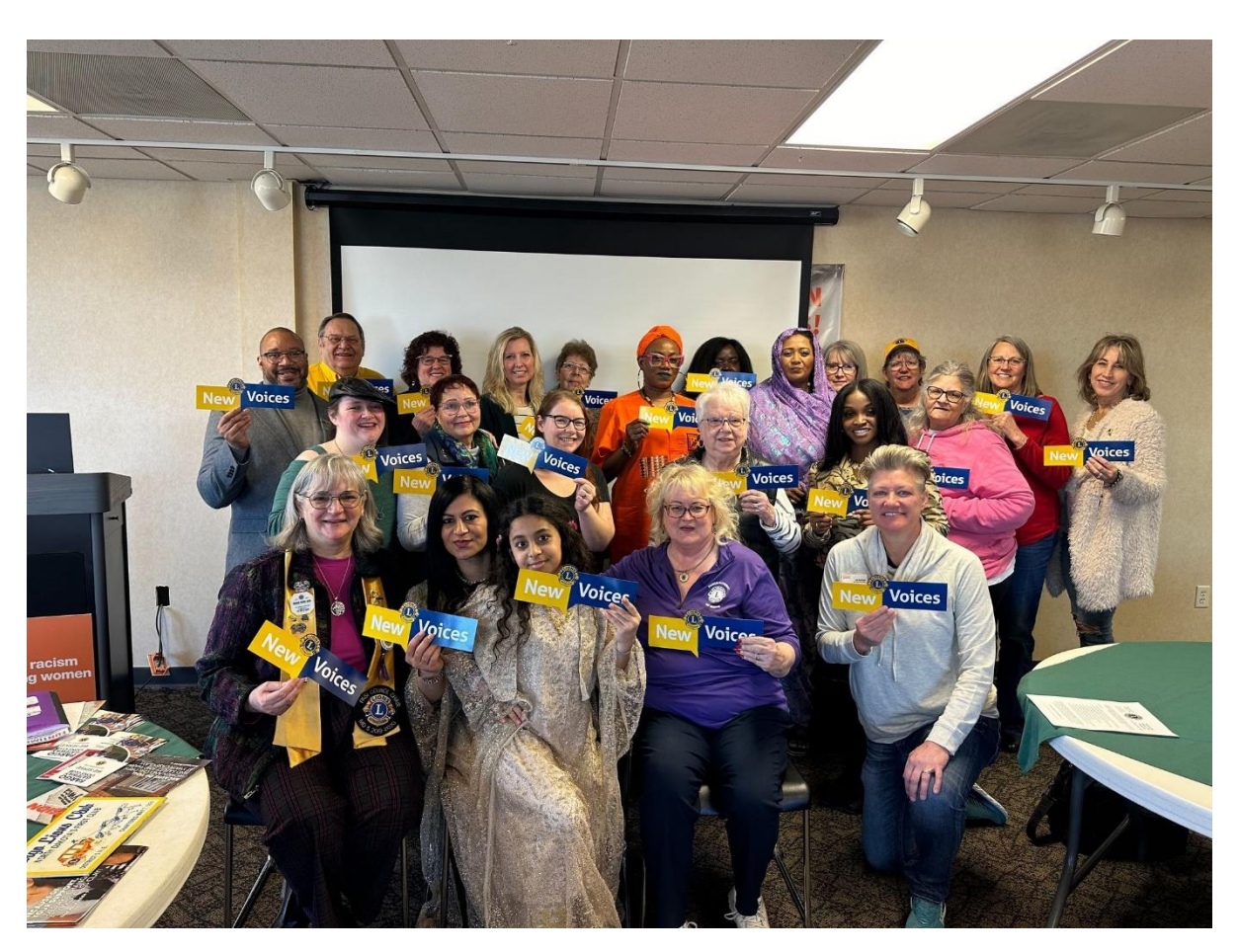
The International Women's Day symposium was sponsored by MD5 New Voices on March 9, and was held at the YWCA facility in Fargo, N.D.